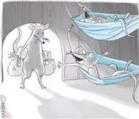
"FREE HAMMOCKS, all over town. It's like a miracle!"