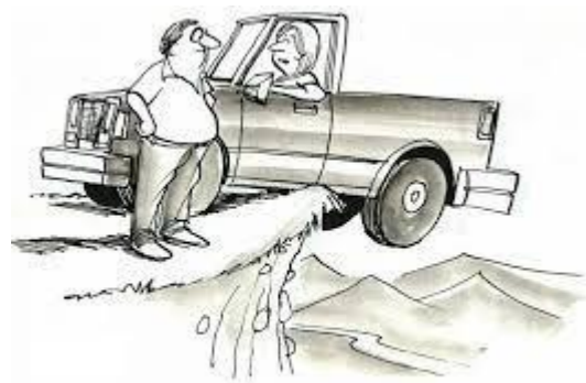
"You'll have to get behind me and push."